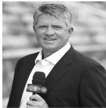
SIMON O'DONNELL AUSTRALIAN CRICKETER

CORPORATE TABLES: $2,000 PLUS GST (INCLUDES TABLE OF 10, ADVERTISING PRE / DURING AND POST LUNCHEON, 10 X $20 TICKETS IN THE LONG LUNCHEON RAFFLE)