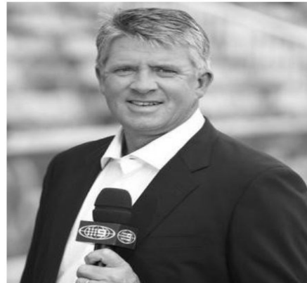
SIMON O'DONNELL AUSTRALIAN CRICKETER

CORPORATE TABLES: $2,000 PLUS GST (INCLUDES TABLE OF 10, ADVERTISING PRE / DURING AND POST LUNCHEON, 10 X $20 TICKETS IN THE LONG LUNCHEON RAFFLE)