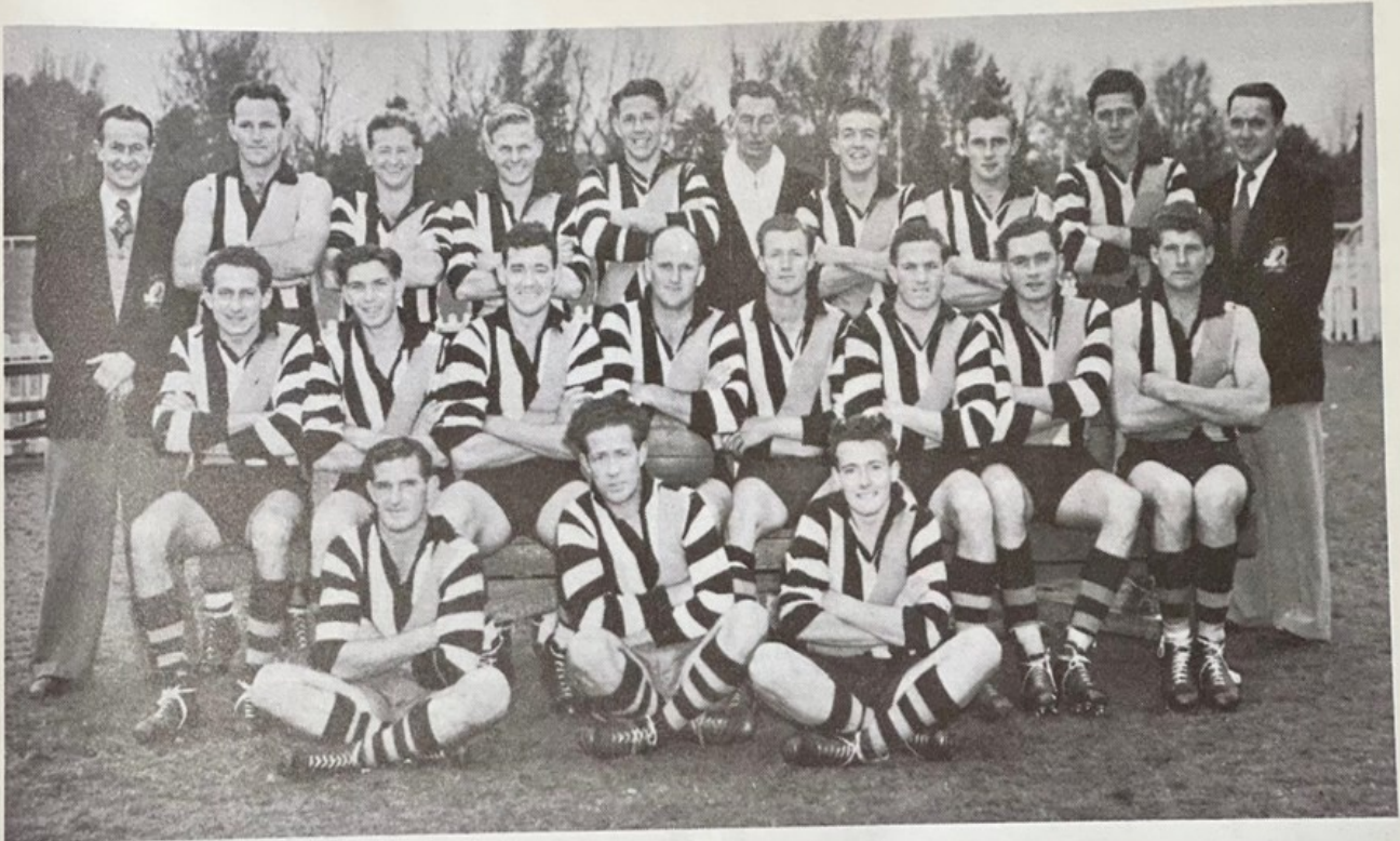
PREMIERS — QUEANBEYAN/ACTON 1953

The siren sounded and it was the first flag for ‘Struggle-town’ for over 10 years. Celebrations went on for several days.