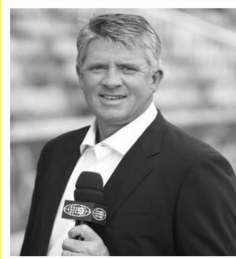
SIMON O'DONNELL AUSTRALIAN CRICKETER

CORPORATE TABLES: $2,000 PLUS GST (INCLUDES TABLE OF 10, ADVERTISING PRE / DURING AND POST LUNCHEON, 10 X $20 TICKETS IN THE LONG LUNCHEON RAFFLE)