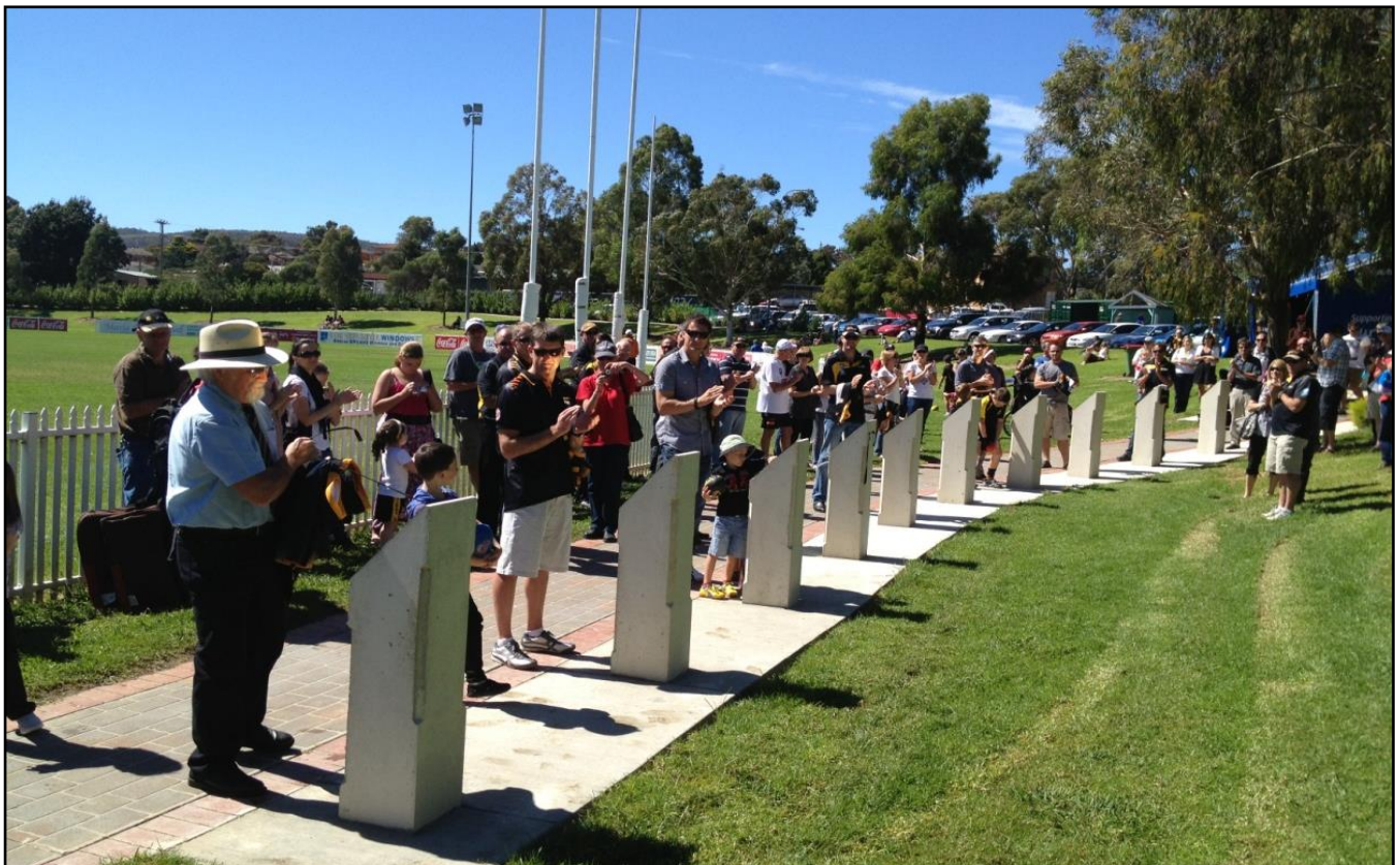
Walk of Honour plaques were provided by the Canberra Trophy. The structures, placement and concrete were provided by Frank Palombi who once again supplied additional structures in 2021.